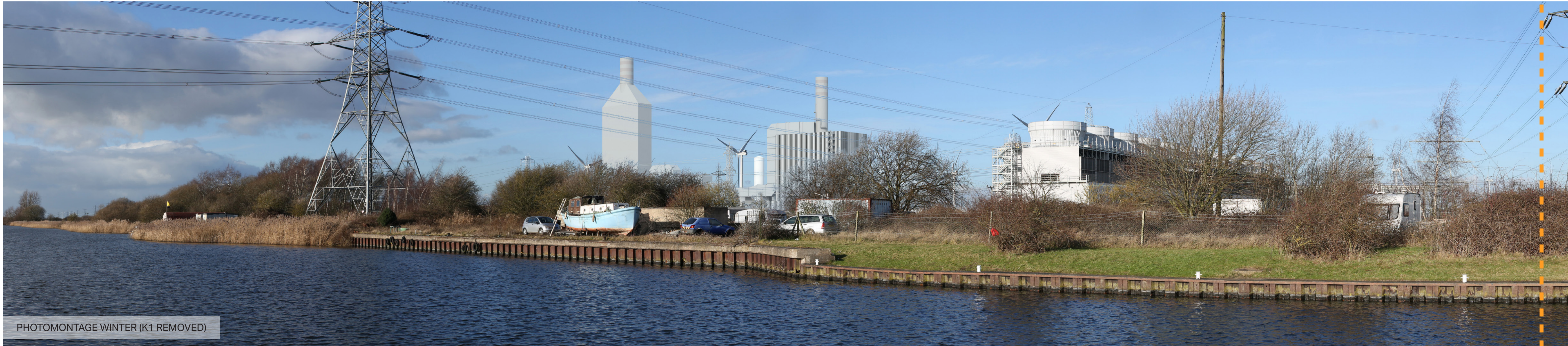
PHOTOMONTAGE WINTER (K1 REMOVED)

90° 85° 80° 75° 70° 65° 60° 55° 50° 45° 40° 35° 30° 25° 20° 15° 10° 5° 0°